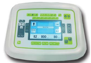
LCD OP console