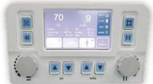
Touch LCD screen